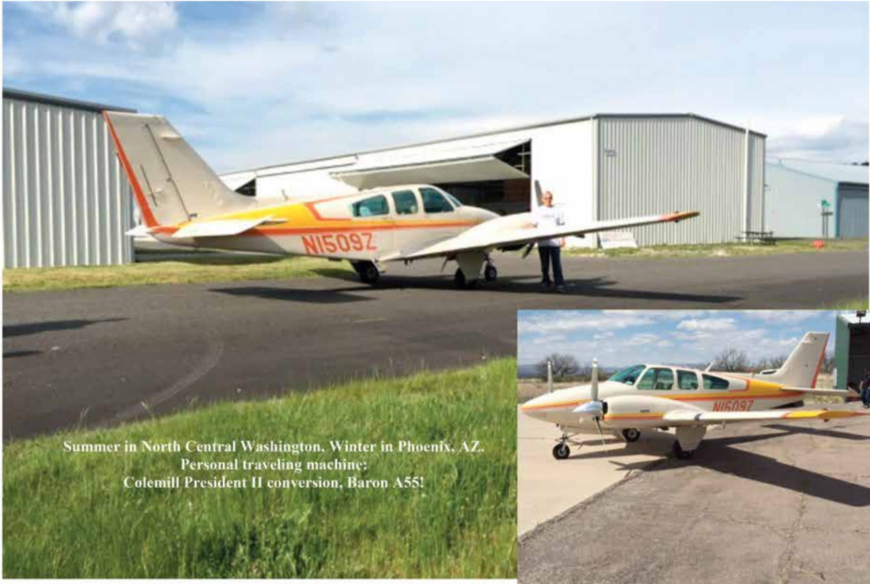
Summer in North Central Washington, Winter in Phoenix, AZ. Personal traveling machine: Colemill President II conversion, Baron A55!

Phone: 253-770-9964 avstarair@att.net www.avstarair.com