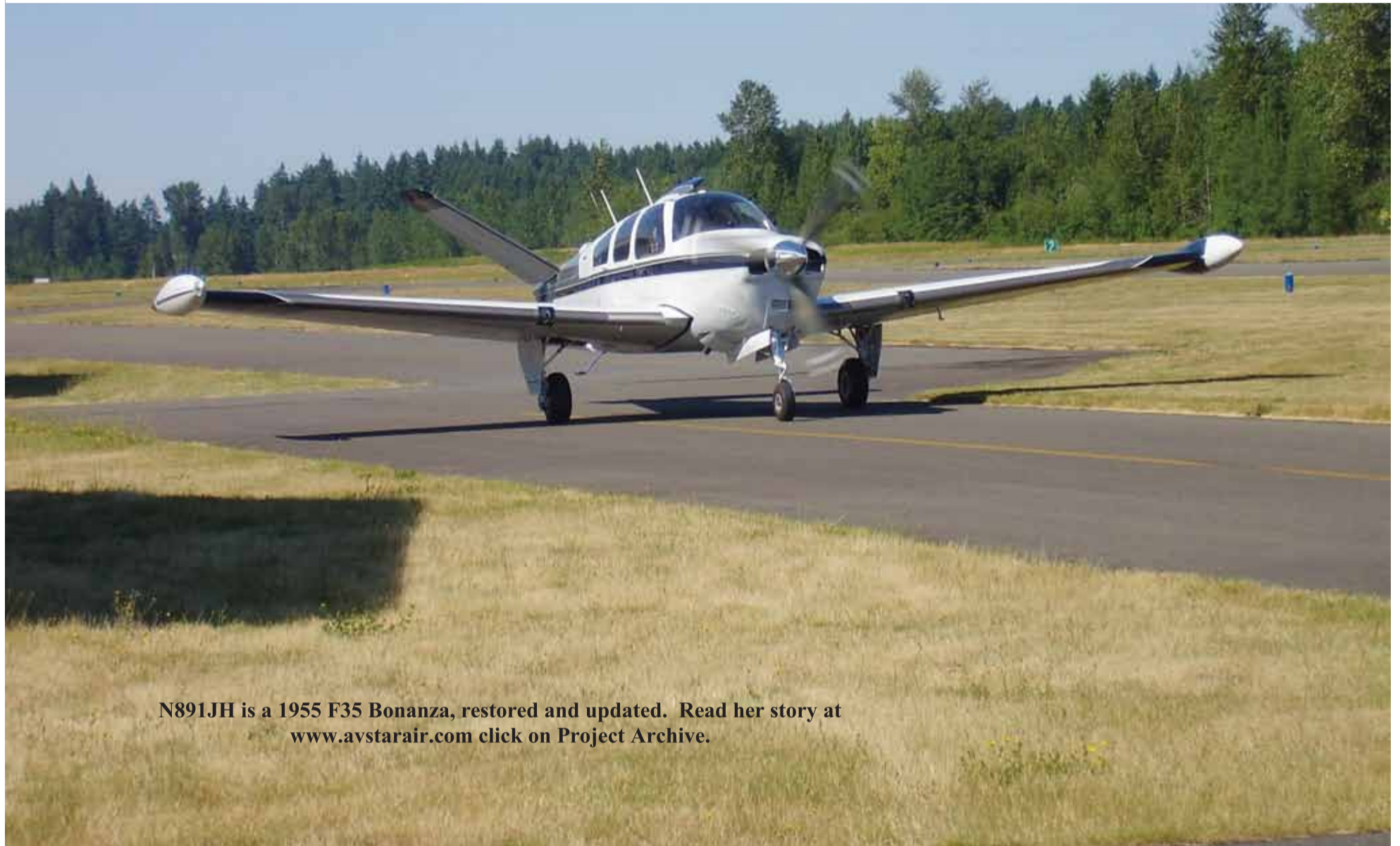
N891JH is a 1955 F35 Bonanza, restored and updated. Read her story at www.avstarair.com click on Project Archive.

Phone: 253-770-9964 Fax: 253-770-0120 avstarair@att.net www.avstarair.com