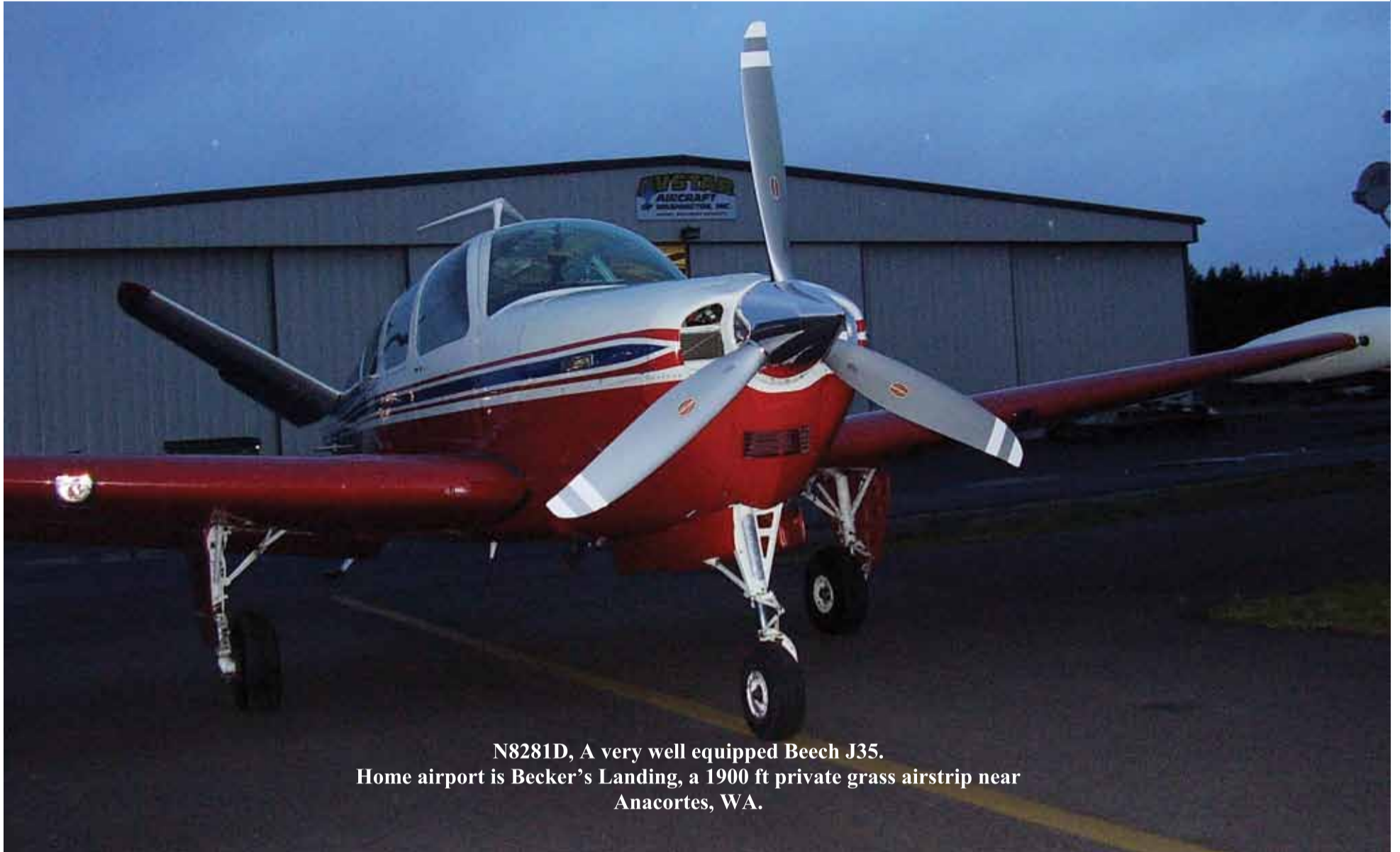
N8281D, A very well equipped Beech J35. Home airport is Becker's Landing, a 1900 ft private grass airstrip near Anacortes, WA.

Phone: 253-770-9964 Fax: 253-770-0120 avstarair@att.net www.avstarair.com