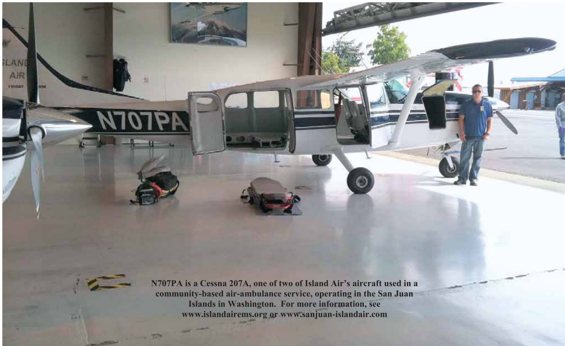
N707PA is a Cessna 207A, one of two of Island Air's aircraft used in a community-based air-ambulance service, operating in the San Juan Islands in Washington. For more information, see www.islandairems.org or www.sanjuan-islandair.com

Phone: 253-770-9964 Fax: 253-770-0120 avstarair@att.net www.avstarair.com