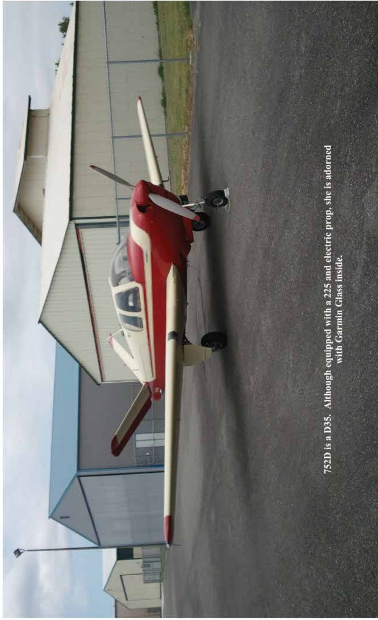
752D is a D35. Although equipped with a 225 and electric prop, she is adorned with Garmin Glass inside.

Phone: 253-770-9964 Fax: 253-770-0120 avstarair@att.net www.avstarair.com